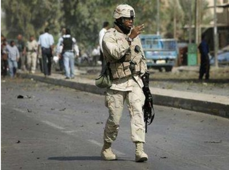
U.S. soldier at the scene of a car bomb attack in Baghdad 10.6.05.