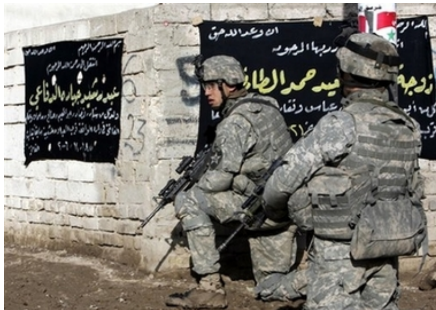
U.S. soldiers from the 5th Battalion, 20th Infantry Regiment look on during an anti-American [translation: anti-Bush military dictatorship] demonstration in Baghdad, Dec. 25, 2006. Soldiers went house to house searching, touching off a protest that forced them to cut the mission short in some parts of the city.