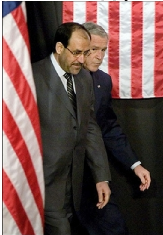
Bush in Amman, Jordan, Nov. 30, meets with his dog, collaborator Iraqi Prime Minister Nouri al-Maliki.