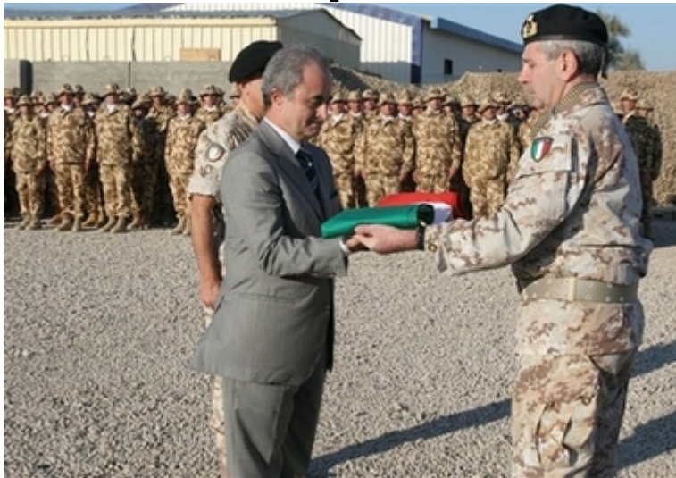
Italian Defense Minister Arturo Parisi, center, receives the Italian flag after its lowering at a military base in Nasiriyah, Dec. 1, 2006, during a ceremony marking the end of the Italian military mission there.