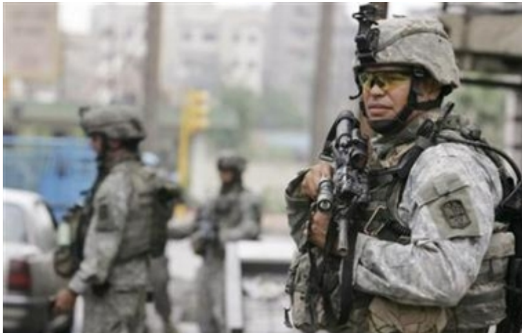
U.S. soldiers from 172nd Stryker Brigade Combat Team at a checkpoint in Baghdad, October 26, 2006.