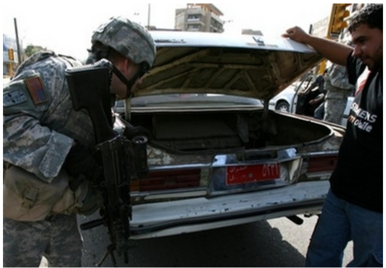
172nd Stryker Brigade Combat Team soldier checks car in central Baghdad's Karradah district, Oct. 24, 2006.