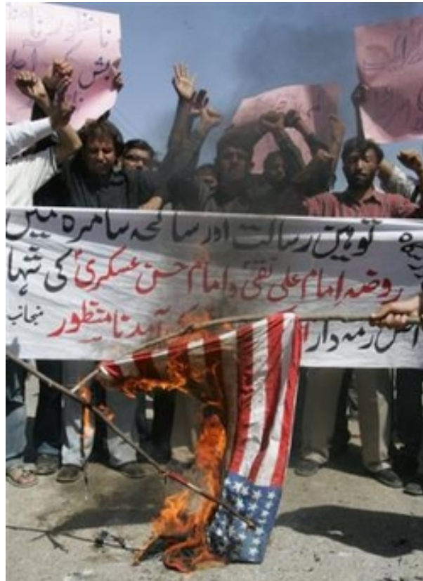
Rally against U.S. President George W. Bush in New Delhi Wednesday, March 1, 2006.