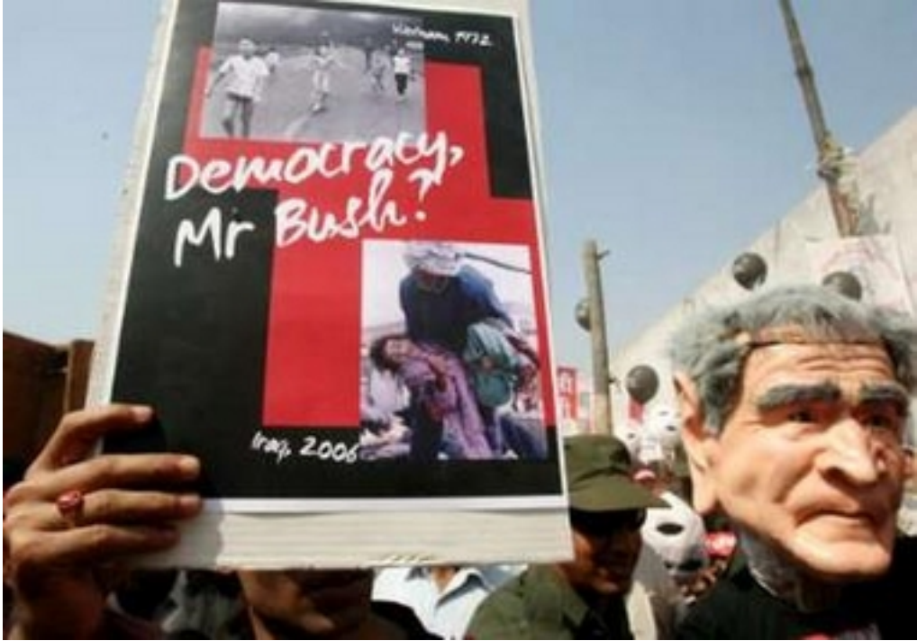
Protest against the visit of U.S. President George W. Bush in New Delhi March 2, 2006.